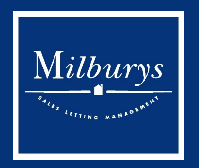
Cottage 'To Let' £1,100 PCM Doynton, Doynton